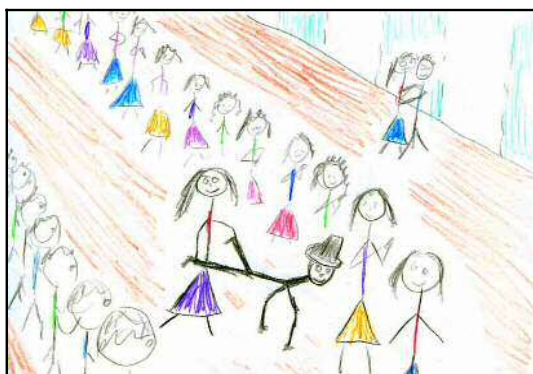
↑ Gennetines Grand Bal - dancing "Polka with Horns" from Lithuania